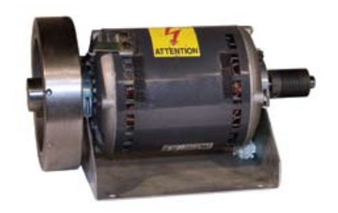
Leading competitor's motor