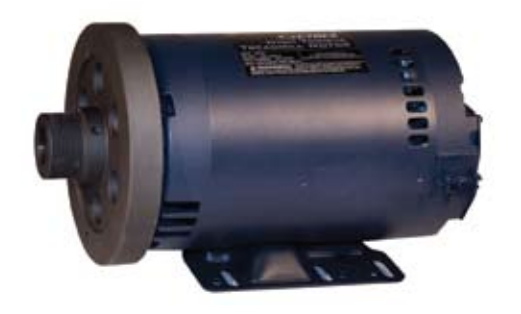
CYBEX 6hp brushless AC motor