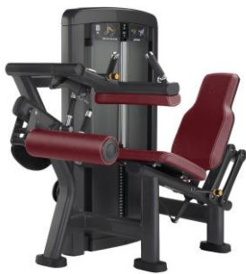
SEATED LEG CURL