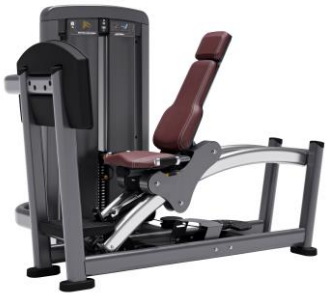
ARC LEG PRESS