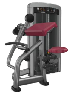
BICEPS CURL - DEPENDENT