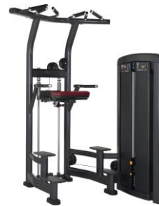
ASSIST DIP / CHIN