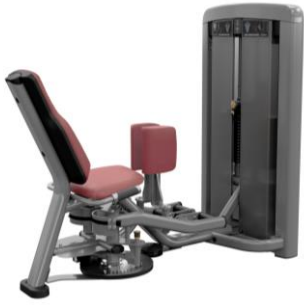
HIP ABDUCTION / ADDUCTION