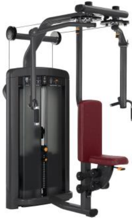
PEC FLY / REAR DELT