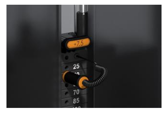
Standard weight stack with one 7.5-lb (3.75 kg) push/pull weight increment.