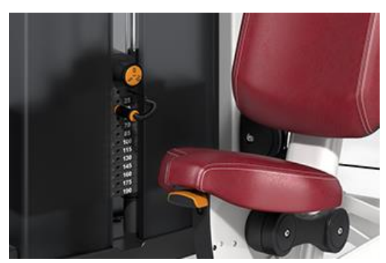
Heavy weight stack with two 5-lb (2.5 kg) dial weight increments. (15% more weight)