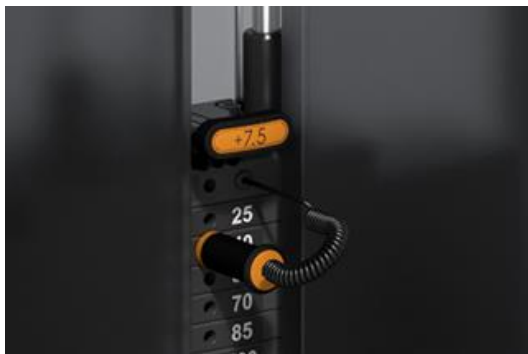
P Weight Stack

Standard weight stack with one 7.5-lb (3.75 kg) push/pull weight increment.