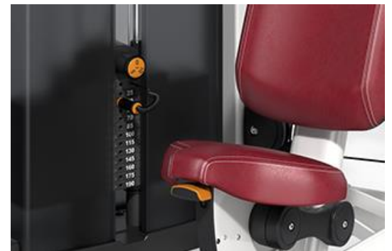
X Weight Stack

Heavy weight stack with two 5-lb (2.5 kg) dial weight increments. (15% more weight)